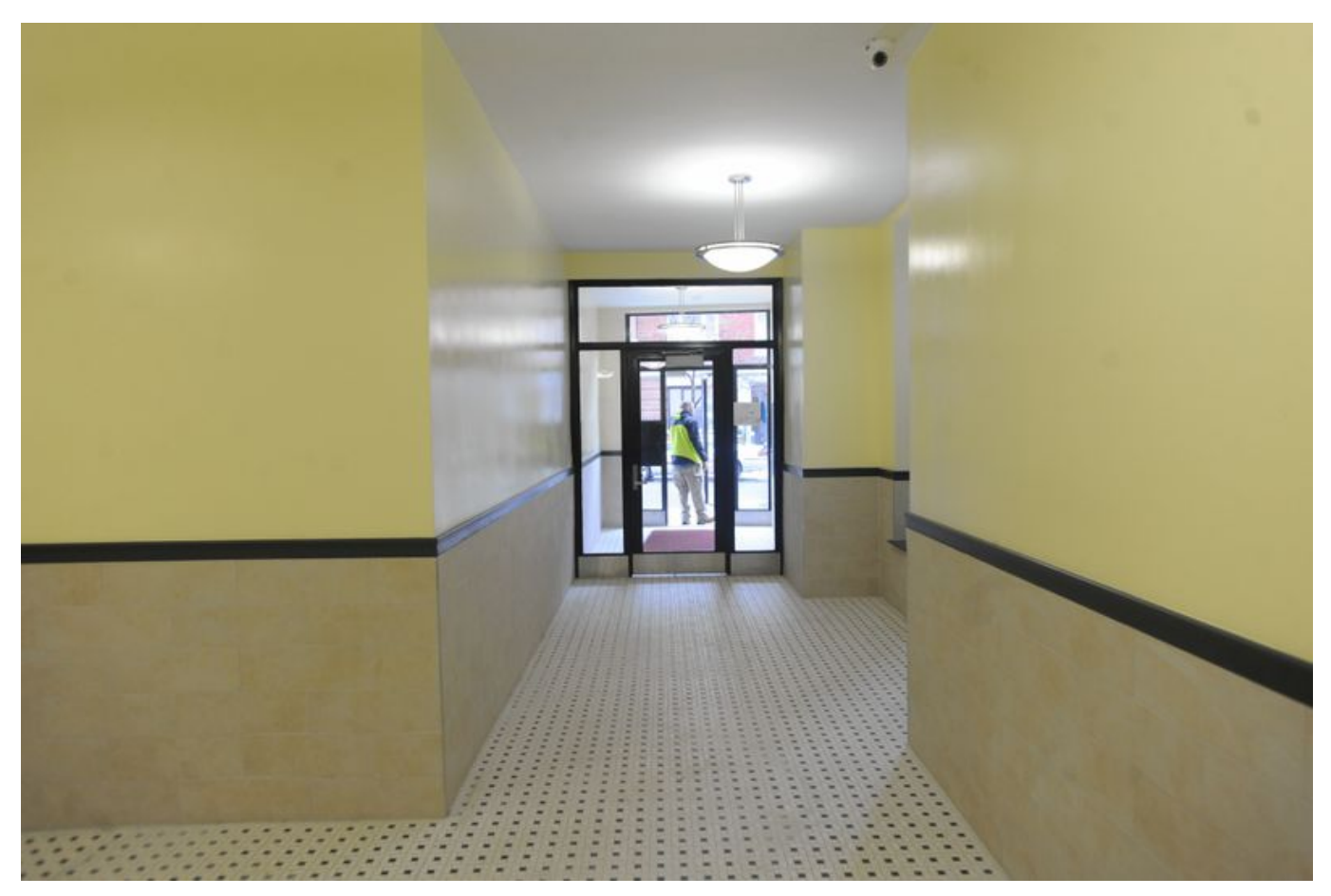
Renovated lobby intrance at 935 Kelly St.

The buildings, at 916, 920, 924, 928 and 935 Kelly St., are a shining example of WFHA's mission, to rehabilitate distressed multi-family housing and keep it affordable for tenants. Kelly Street is the first of six projects the for-profit developer has begun in the Bronx. They've bought 12 neglected buildings and the mortgages for two more.