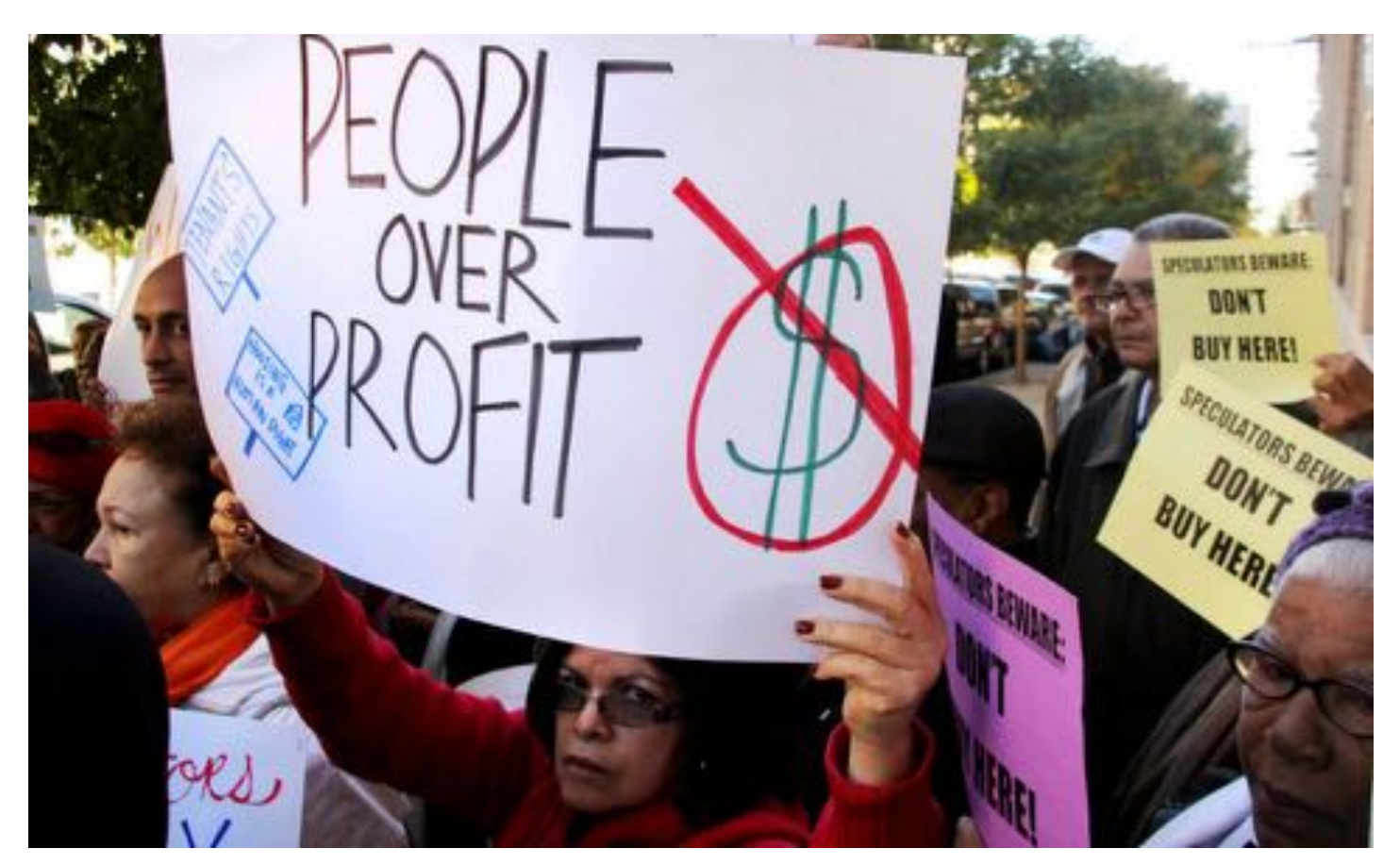
<u>UHAB Press Conference: Fighting Predatory Equity</u>. Tenants, advocates, and elected officials joined UHAB to call on building owner Vantage and private-equity investment group Lone Star Funds to sell ten buildings in foreclosure at a sustainable price to ensure the buildings' conditions do not deteriorate.

CS: Tell me what happened in terms of City-owned property in the 1990s. How did UHAB respond to those changes?