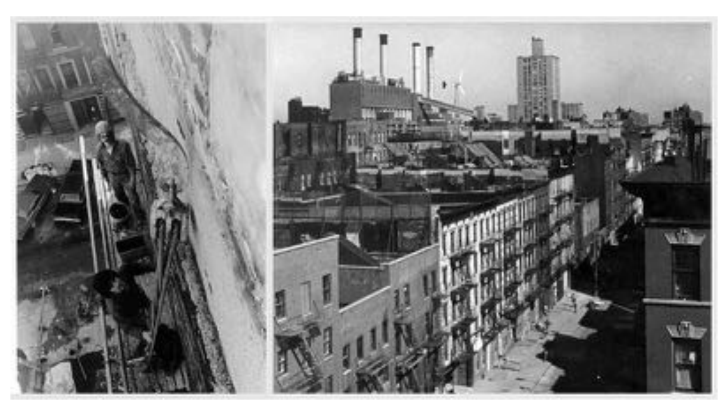
Renovating 519 East 11th Street, a homesteading project that become home to the first roof-mounted, urban windmill in the United States

CS: After this initial period of self-initiated homesteading projects, what happened next?