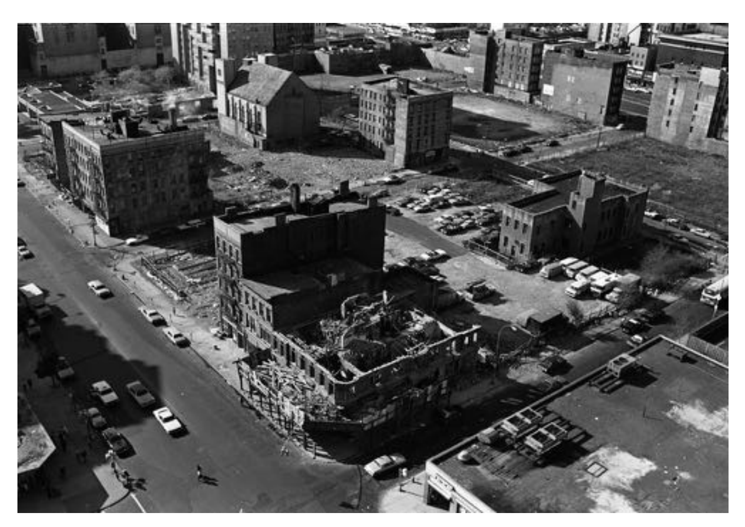
Clinton Street and Grand Street, 1980

evolution from addressing the crisis of abandonment to contemporary crises of foreclosure, speculation, and affordability. –C.S.