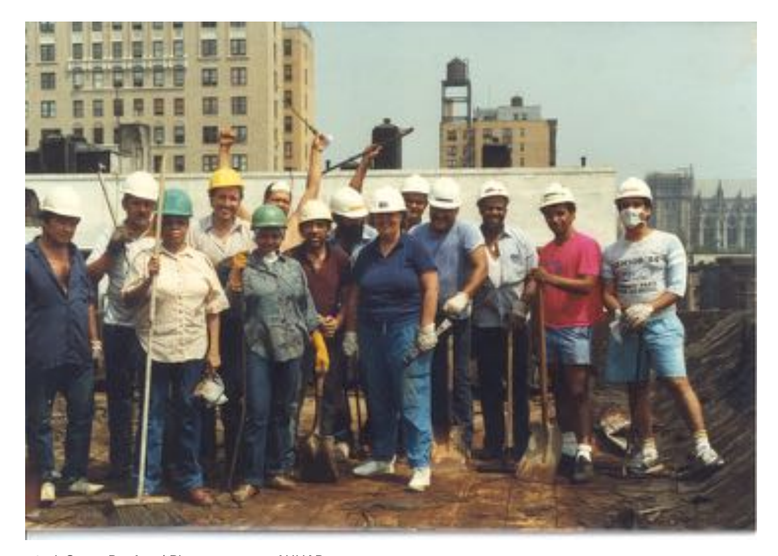
105th Street Rooftop | Photo courtesy of UHAB

In this context of wholesale abandonment, UHAB was founded on the idea that local people are able, with their own hands and some technical assistance, to solve their own housing problems, to stabilize their neighborhoods, and to build up the urban fabric within those neighborhoods.