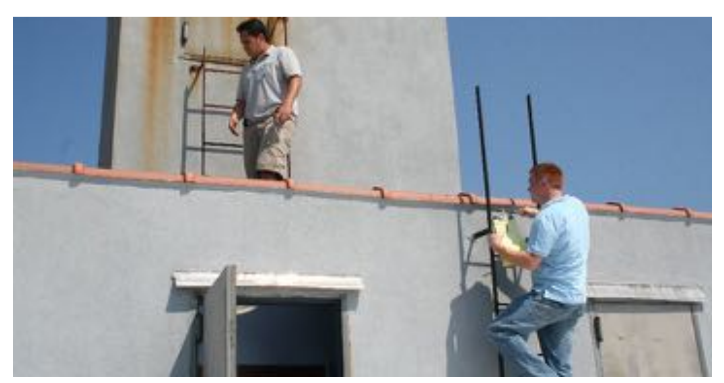
Community Environmental Center (CEC) partners with UHAB on its Weatherization Assistance Program, shown here auditing the roof of 1715 Nelson Avenue

CS: As UHAB has adapted over the years to meet the housing challenges of the day, what do you see as the biggest obstacles to meeting the housing needs of New Yorkers today, heading into 2013?