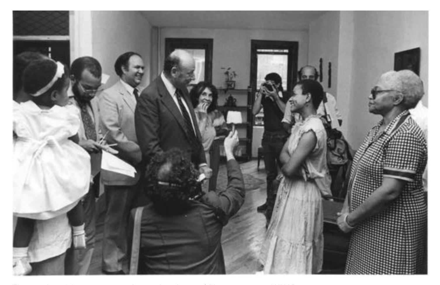
The opening of the co-op at 985 Amsterdam Avenue

CS: Let's talk a little bit about the technical advice and the training aspects of the work. Were these considered to be transferable skills to other aspects of people's lives?