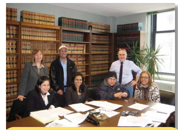
Tenants from 72 Clinton Street, with help from Brooklyn Law School students and UHAB, closed their co-op's loan on March 4, 2010.

The efforts of all those involved paid off on March 4. when the loan for the 19-unit Lower East Side building closed, financing the payment of the remaining tax arrears. Congrats to all!